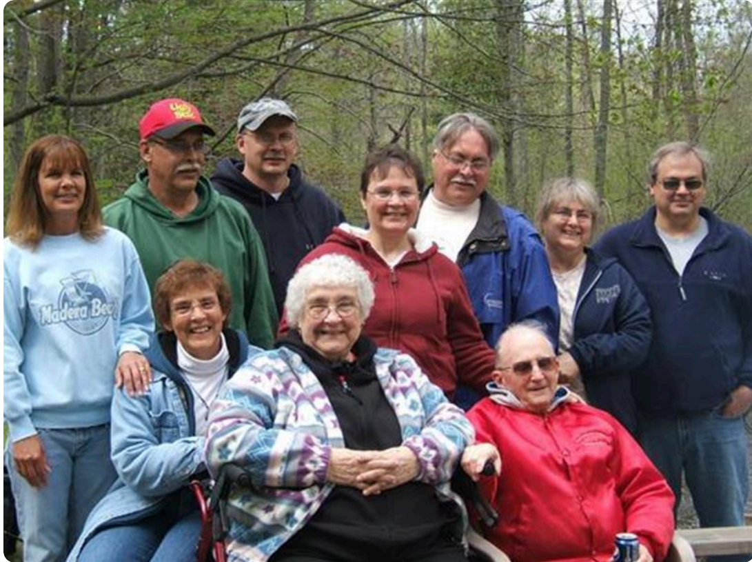
Family at the river